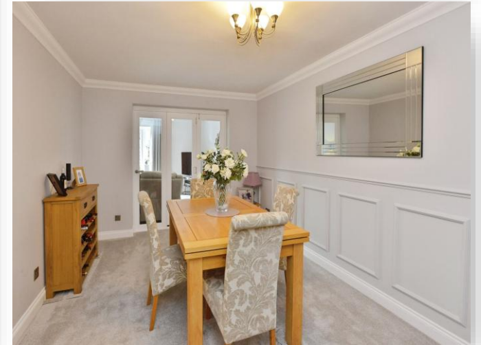
Watts Close, Hanslope Milton Keynes MK19 7NG