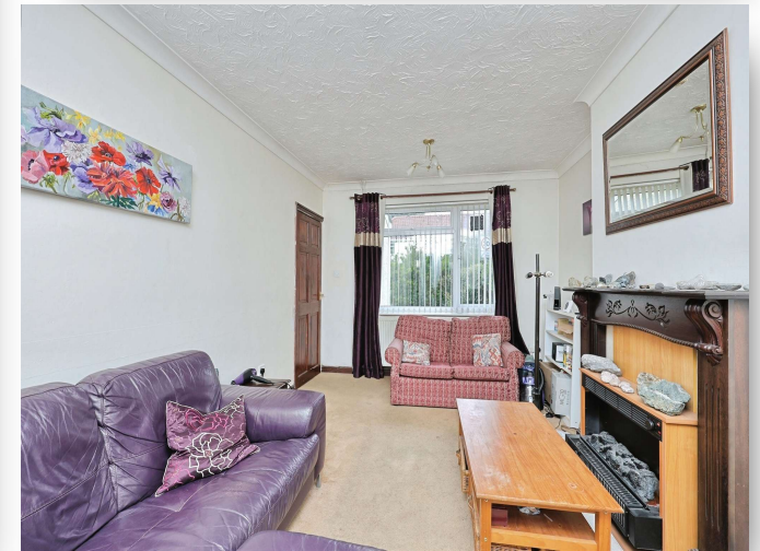
Lound Road, Norwich NR4 7JQ