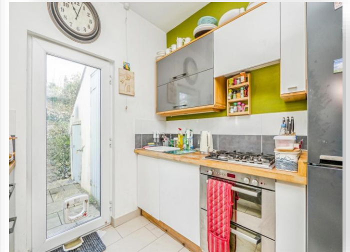
Machen Street, Penarth, CF64 2UB