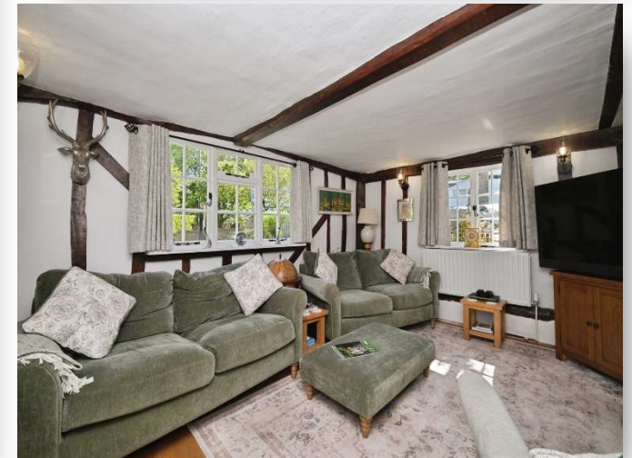
Wisteria Cottage Cambridge Road, Thundridge Ware SG12 0SU