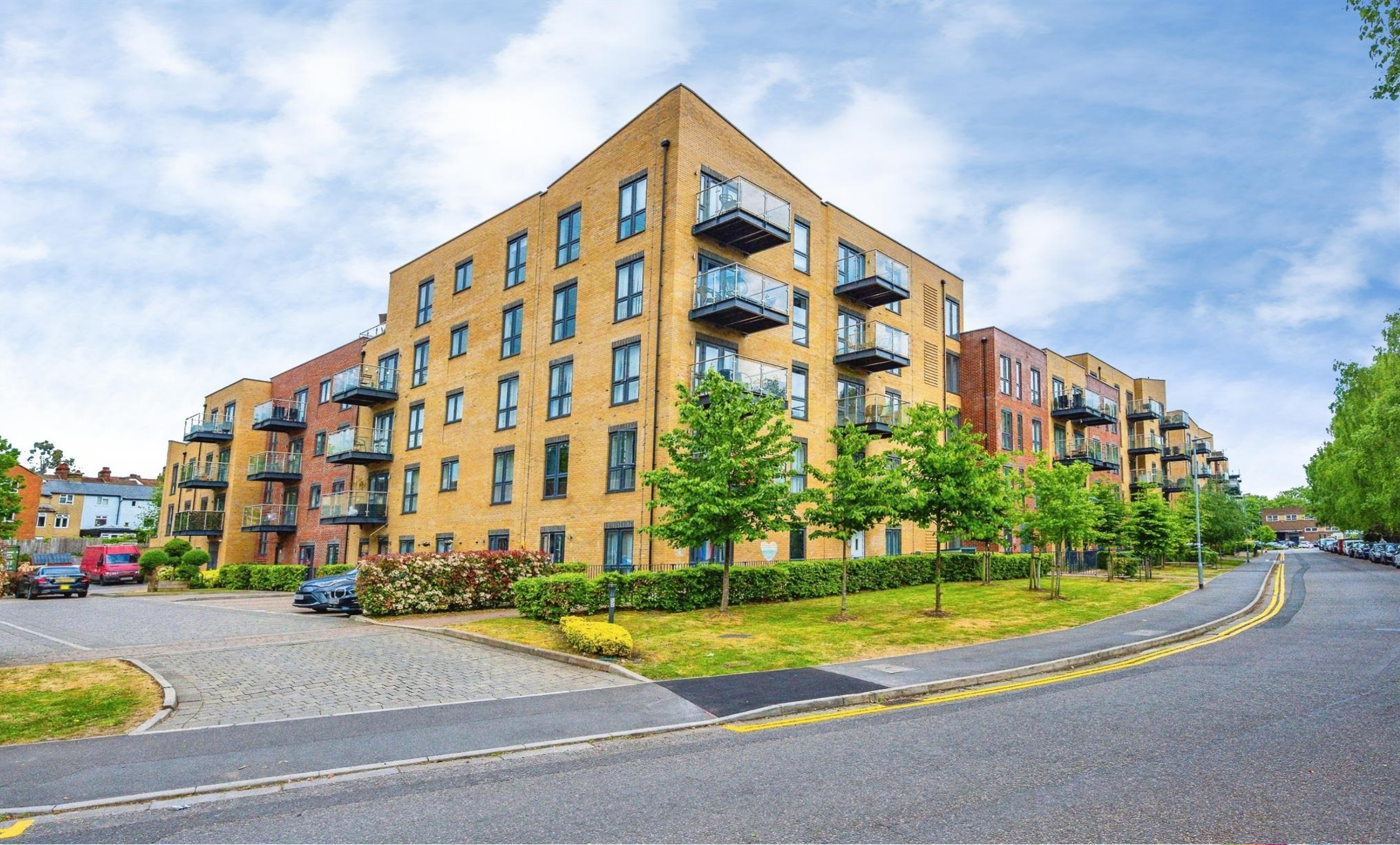
Regents House Frogmore Road, Hemel Hempstead HP3 9GP