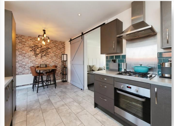
Holt Close, Middlesbrough TS5 8FG