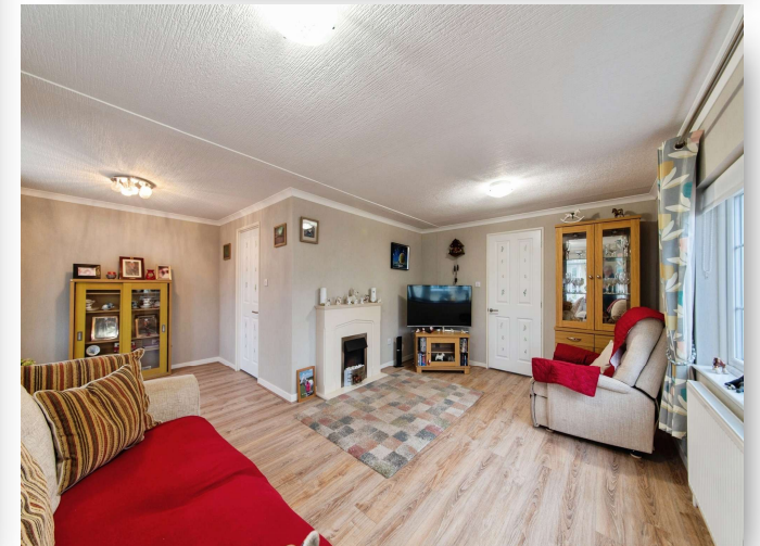
Gattington Park Hawthorn Hill, Dogdyke Lincoln LN4 4XA