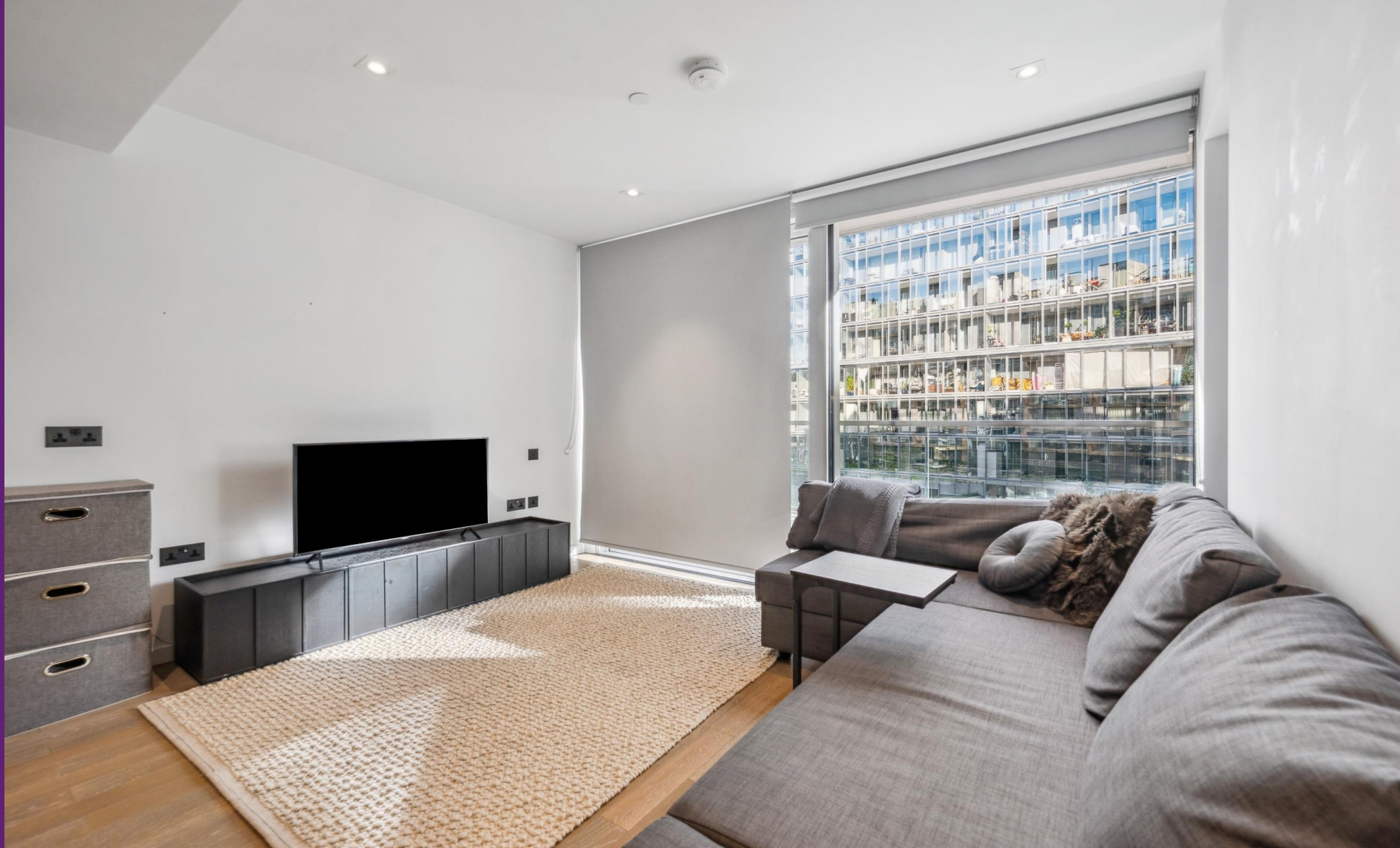
Faraday House Aurora Gardens, SW11