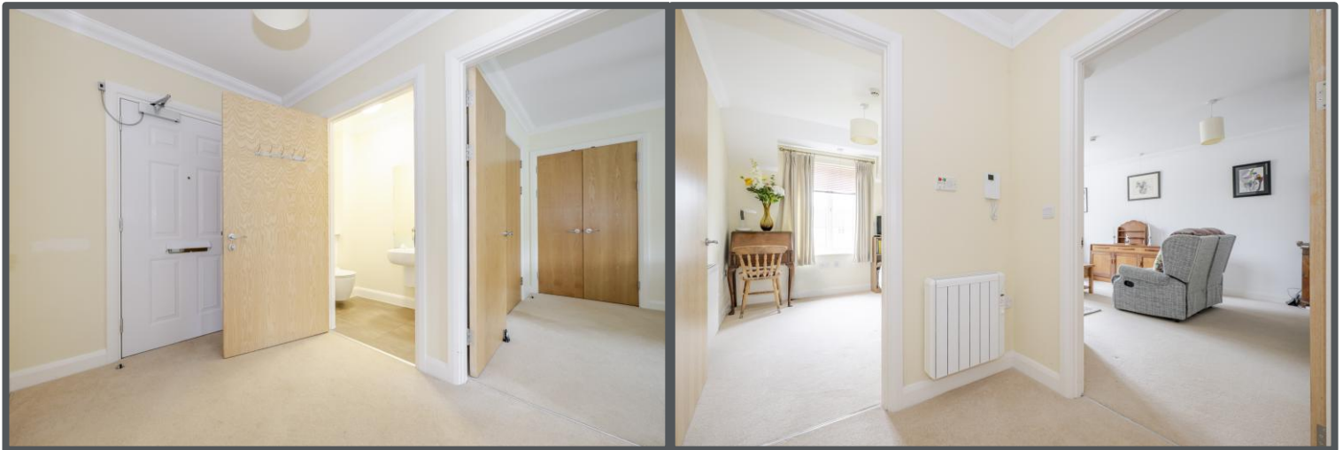
Illustration for identification purposes only, measurements are approximate, not to scale. (ID1291235)

Approximate Gross Internal Area = 63.5 sq m / 683 sq ft