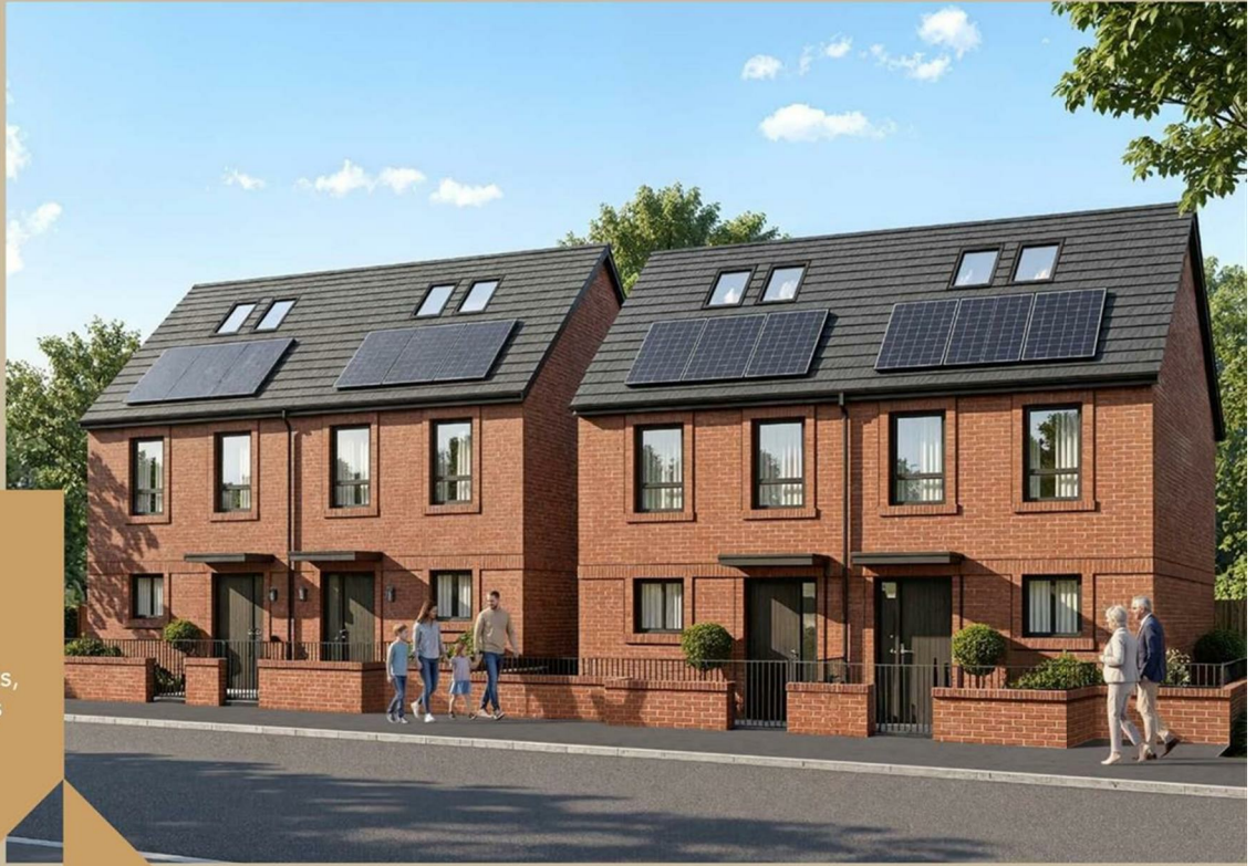
Artist's impressions are used for illustration purposes only. Elevations, external treatments, brick, roof tile colour and window positions may vary.

Offering practical layouts, energy-efficient features and modern finishes throughout