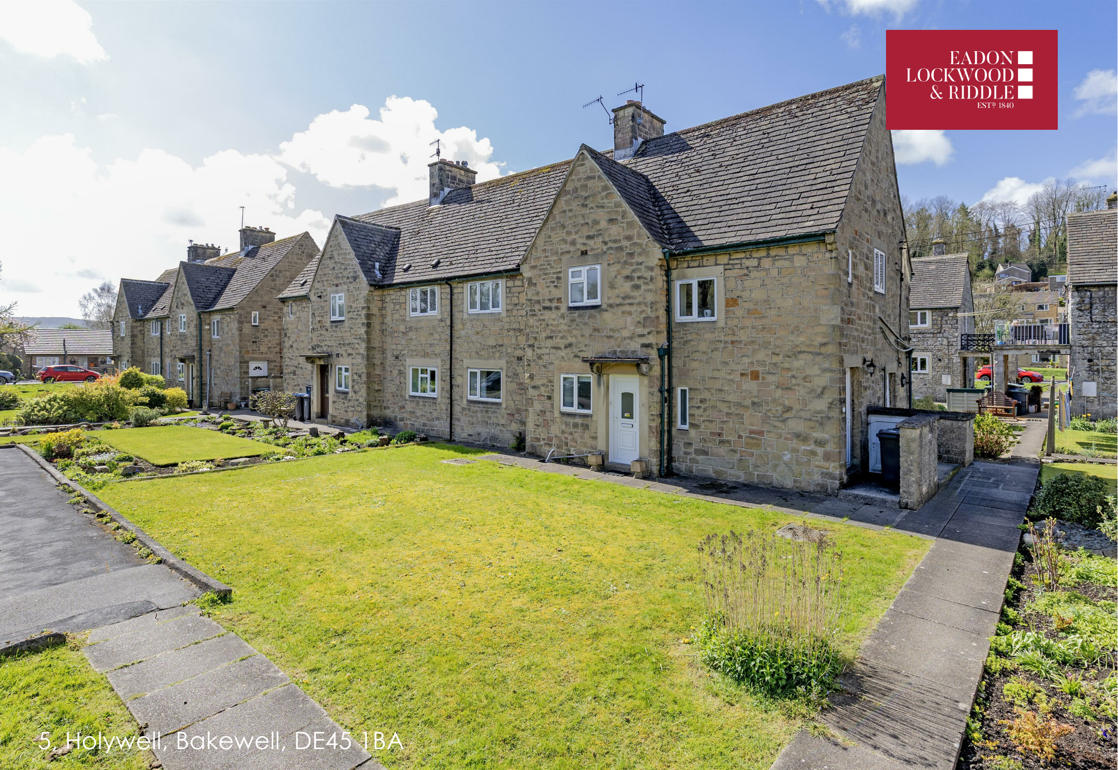
5, Holywell, Bakewell, DE45 1BA