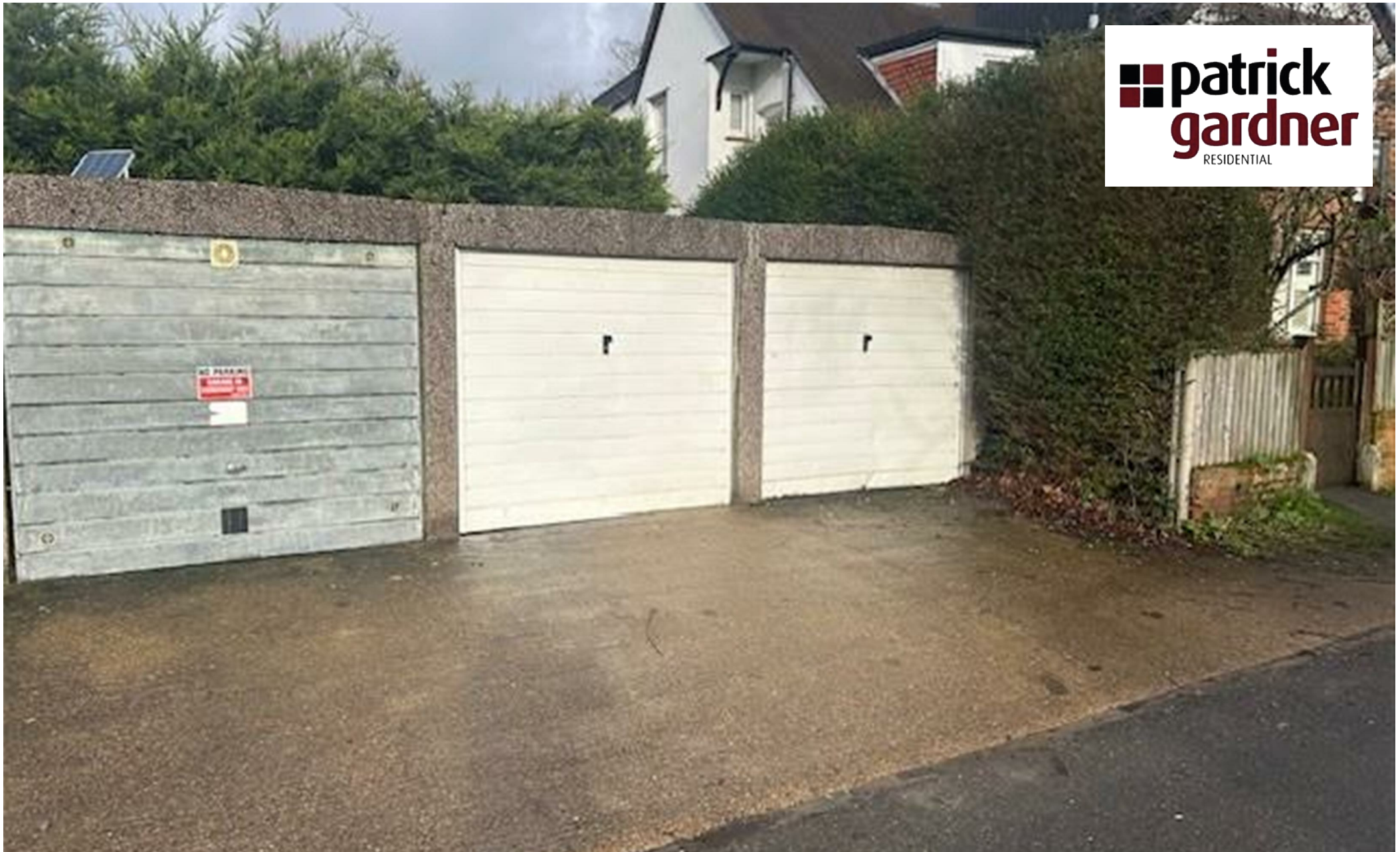
Garage, Woodvill Road, Leatherhead, KT22 7BP