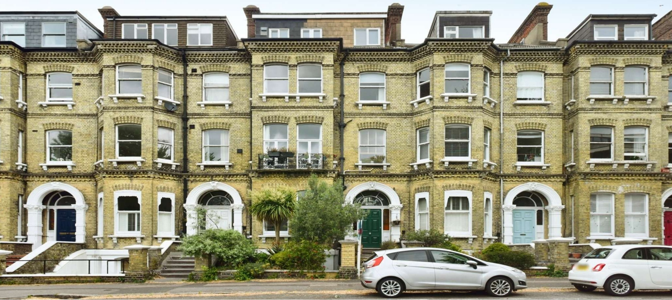
Cromwell Road, Hove BN3 3EA