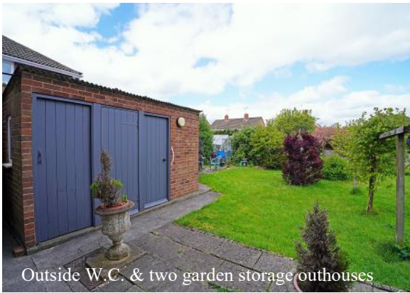
Outside W.C. & two garden storage outhouses