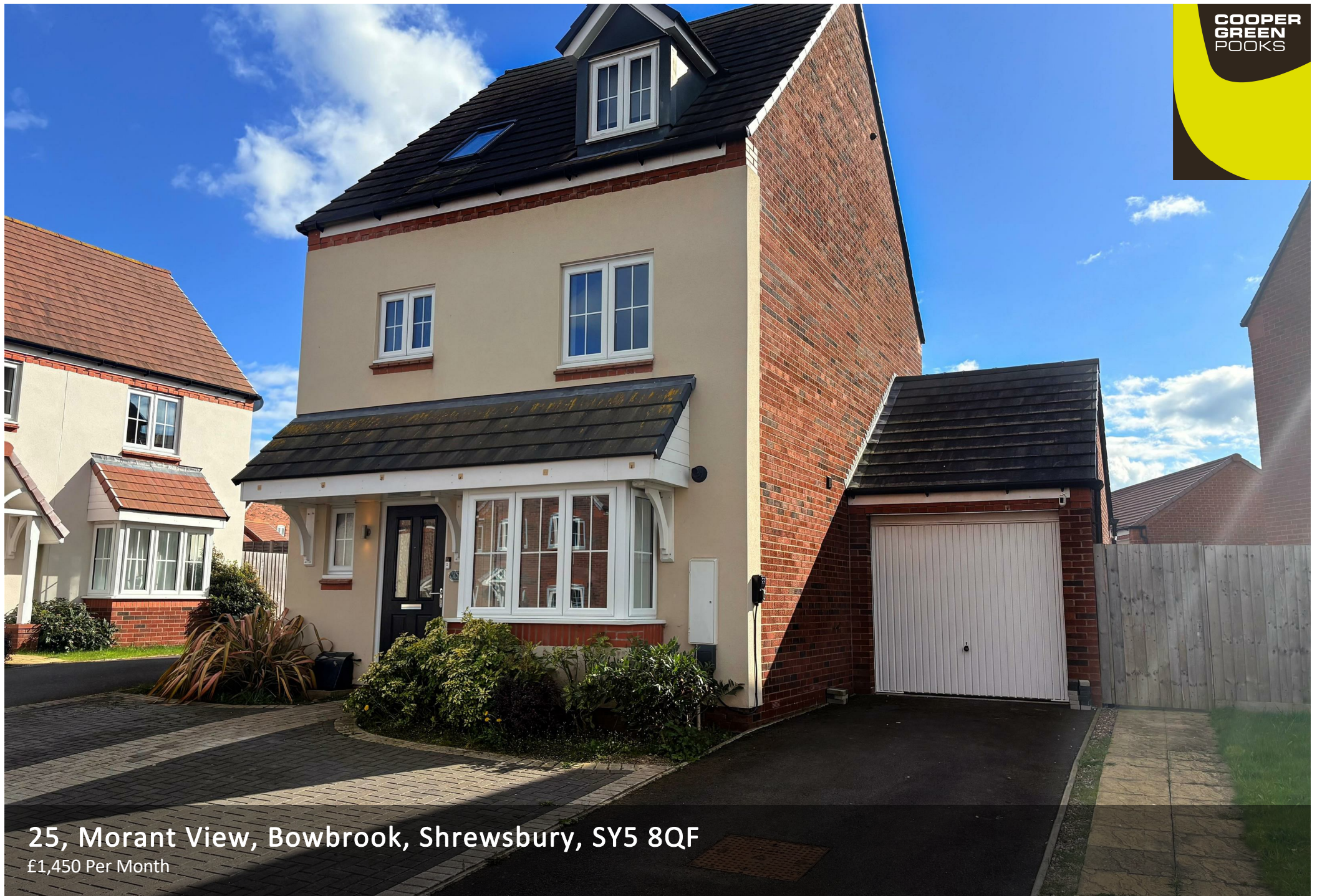
25, Morant View, Bowbrook, Shrewsbury, SY5 8QF £1,450 Per Month