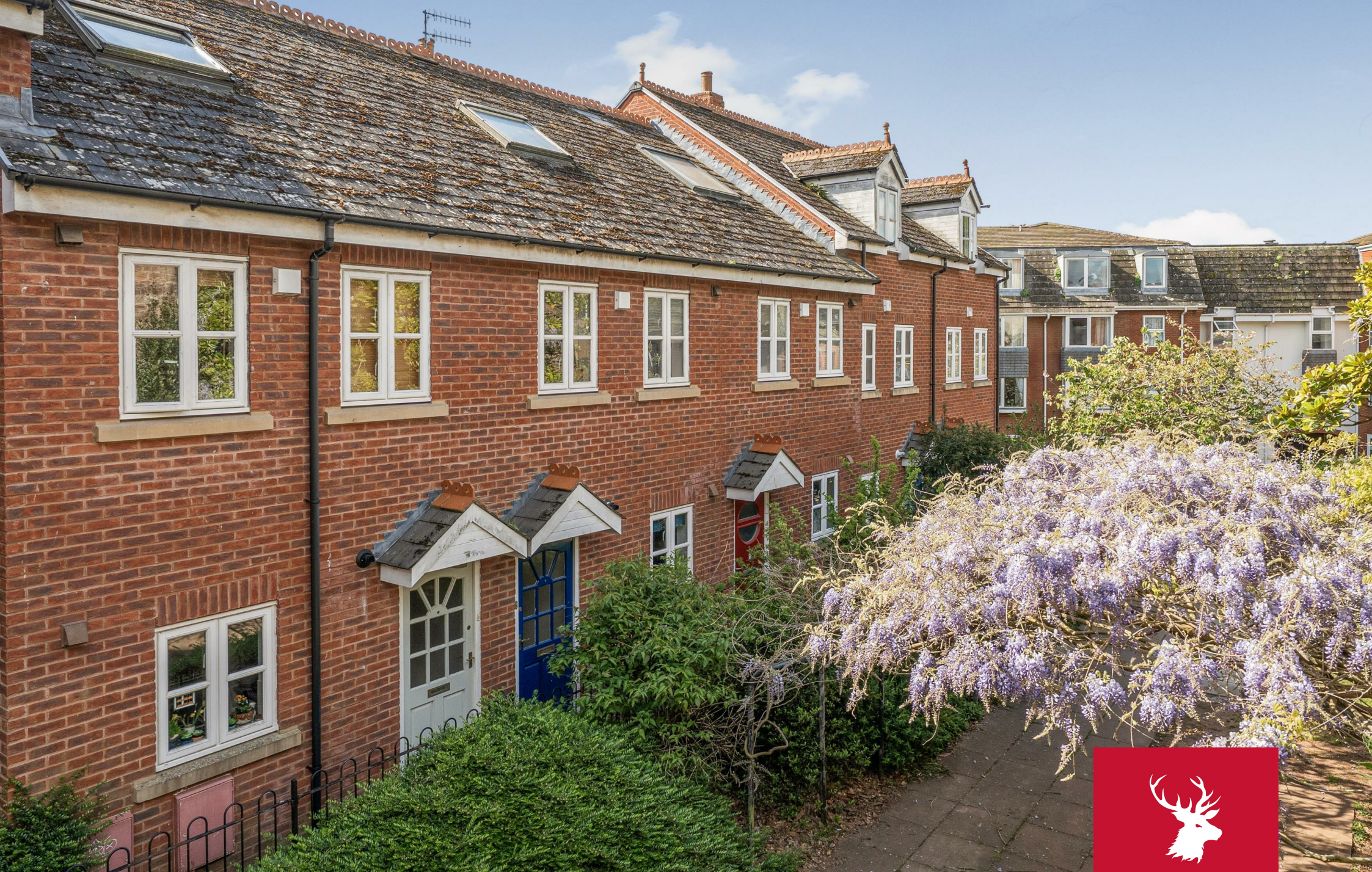
4, Priory Gardens