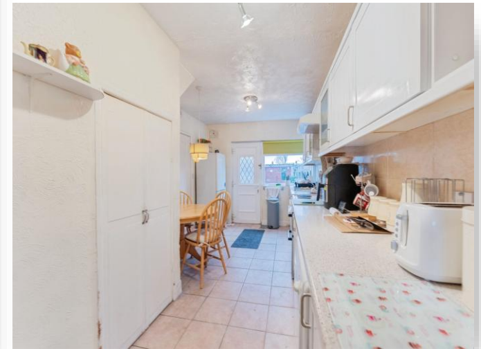
Maple Avenue, Little Sutton Ellesmere Port CH66 3QU