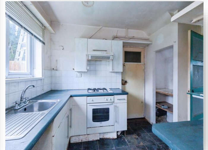
Netherhall Road, Leicester LE5 1DP