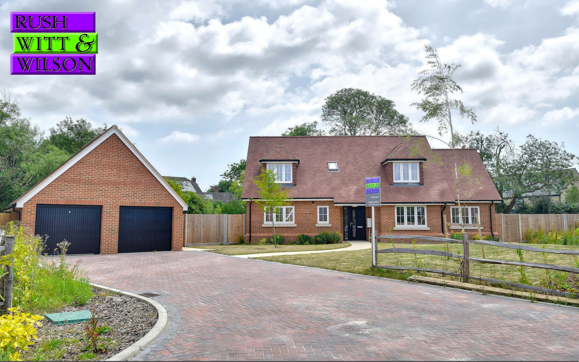
Aspen Lodge, Tenterden Road, Appledore, Kent TN26 2AL Offers In Excess Of £950,000