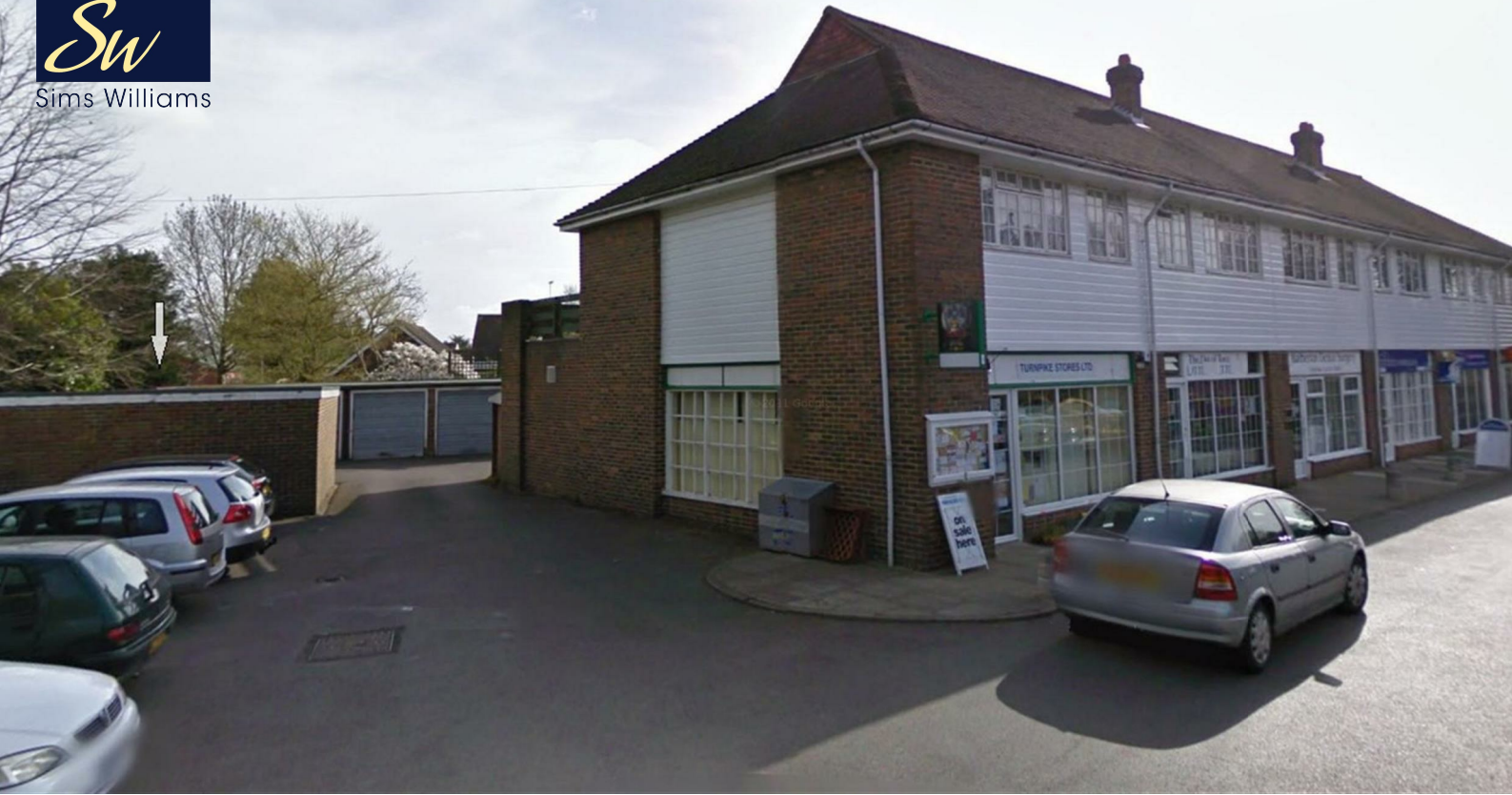
GARAGE 8, MAPLE PARADE THE STREET, WALBERTON, WEST SUSSEX, BN18 OPR