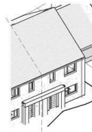
Scale 1:100 0 2m 4m 6m