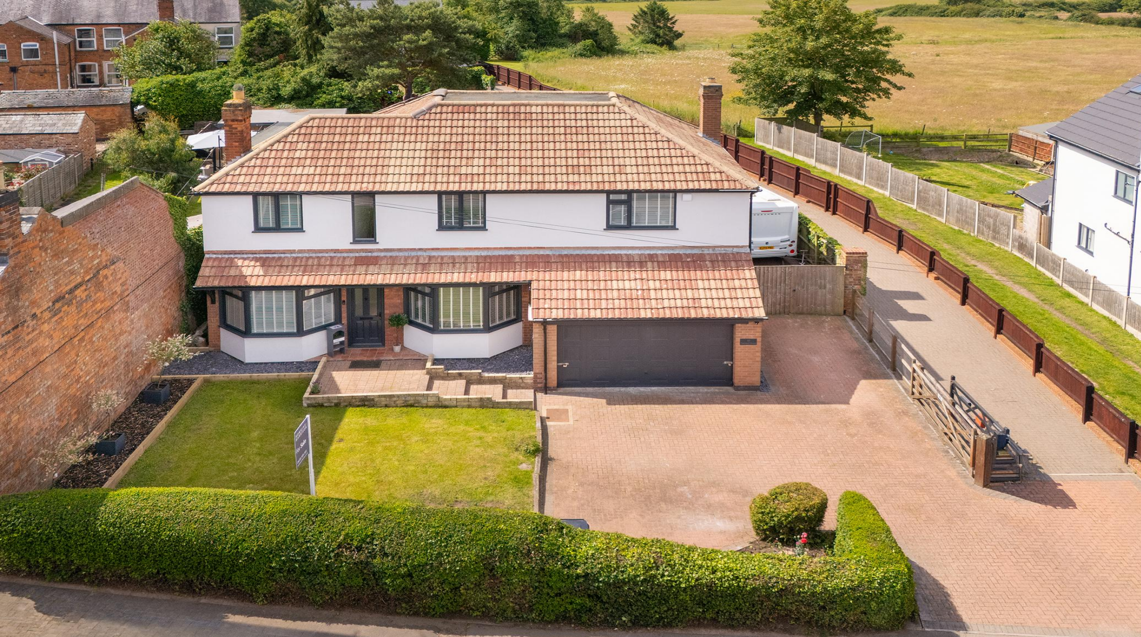
Twinwell House, 45 Main Street, Frolesworth, Lutterworth, LE17 5EE