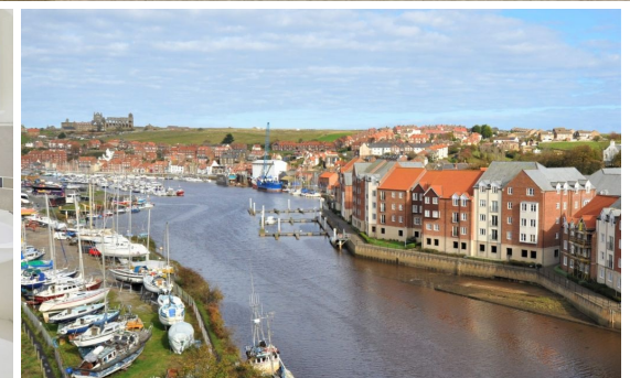
11 TURNBULL COURT, WHITEHALL LANDING- 2 bed Apartment -£229,950