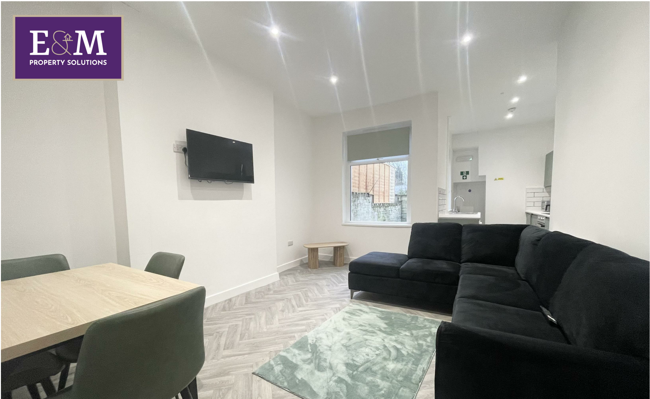
ROOM 2, 157 Coal Clough Lane, Burnley, BB11 4NJ £100 Per week