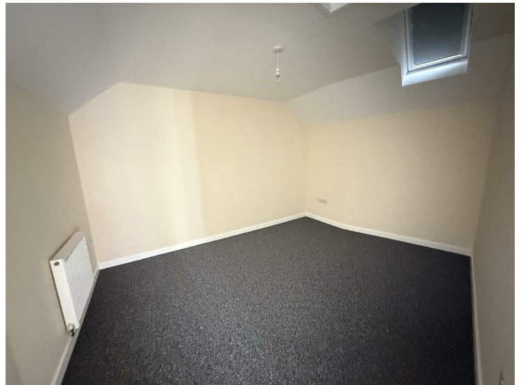
Velux roof window, radiator.