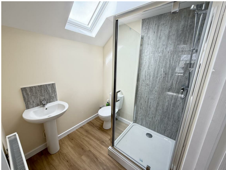
With wash hand basin, shower, toilet, velux roof window