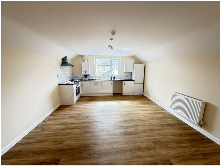
Having fitted kitchen units incorporating base units, single drainer sink unit, fitted oven and hob

23'1" x 13'10" overall (7.04m x 4.22m overall)