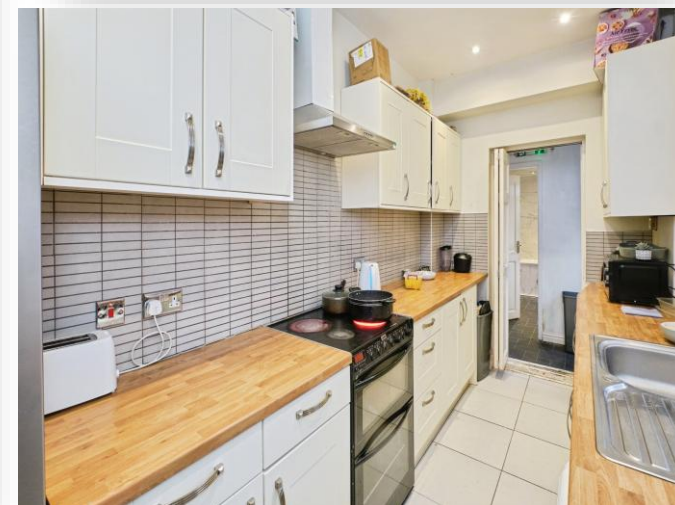
Ridgeway, Edgbaston Birmingham B17 8JB