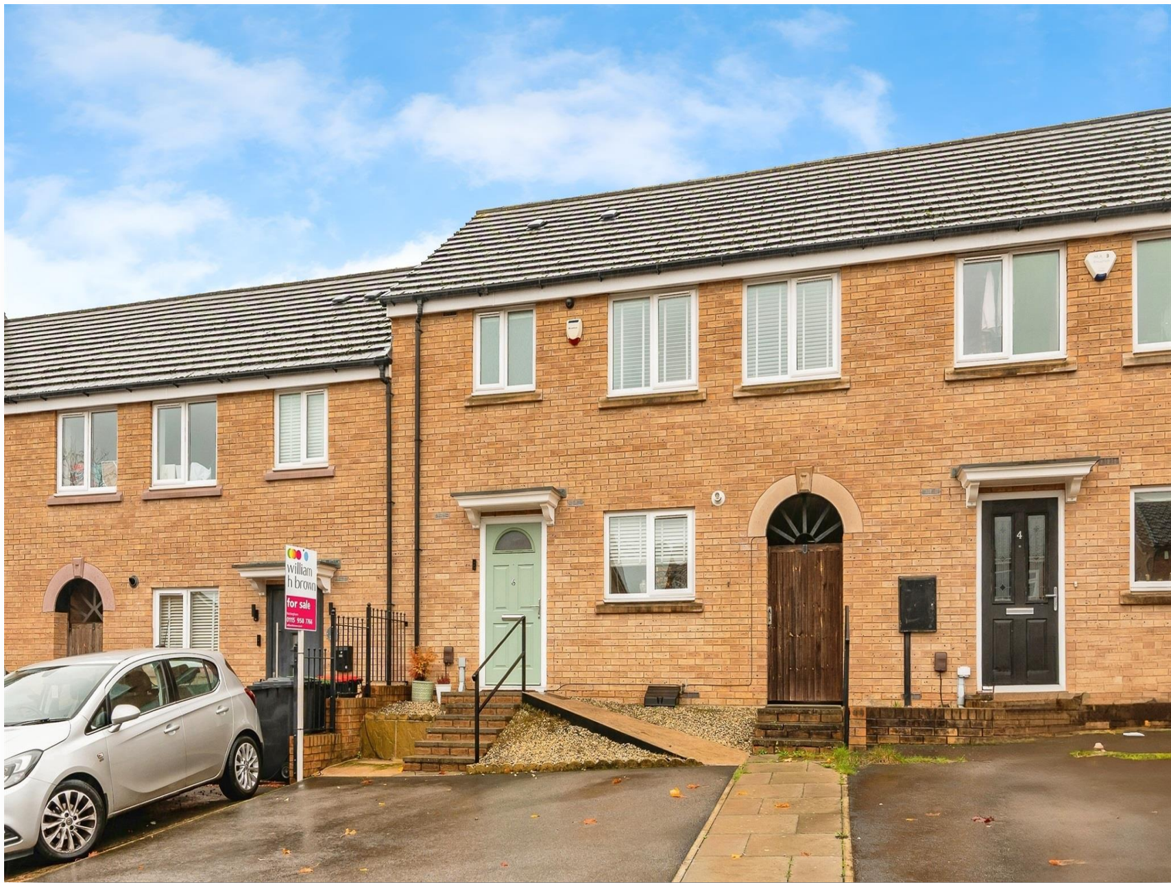
Tyrian Street, Giltbrook Nottingham NG16 2WL