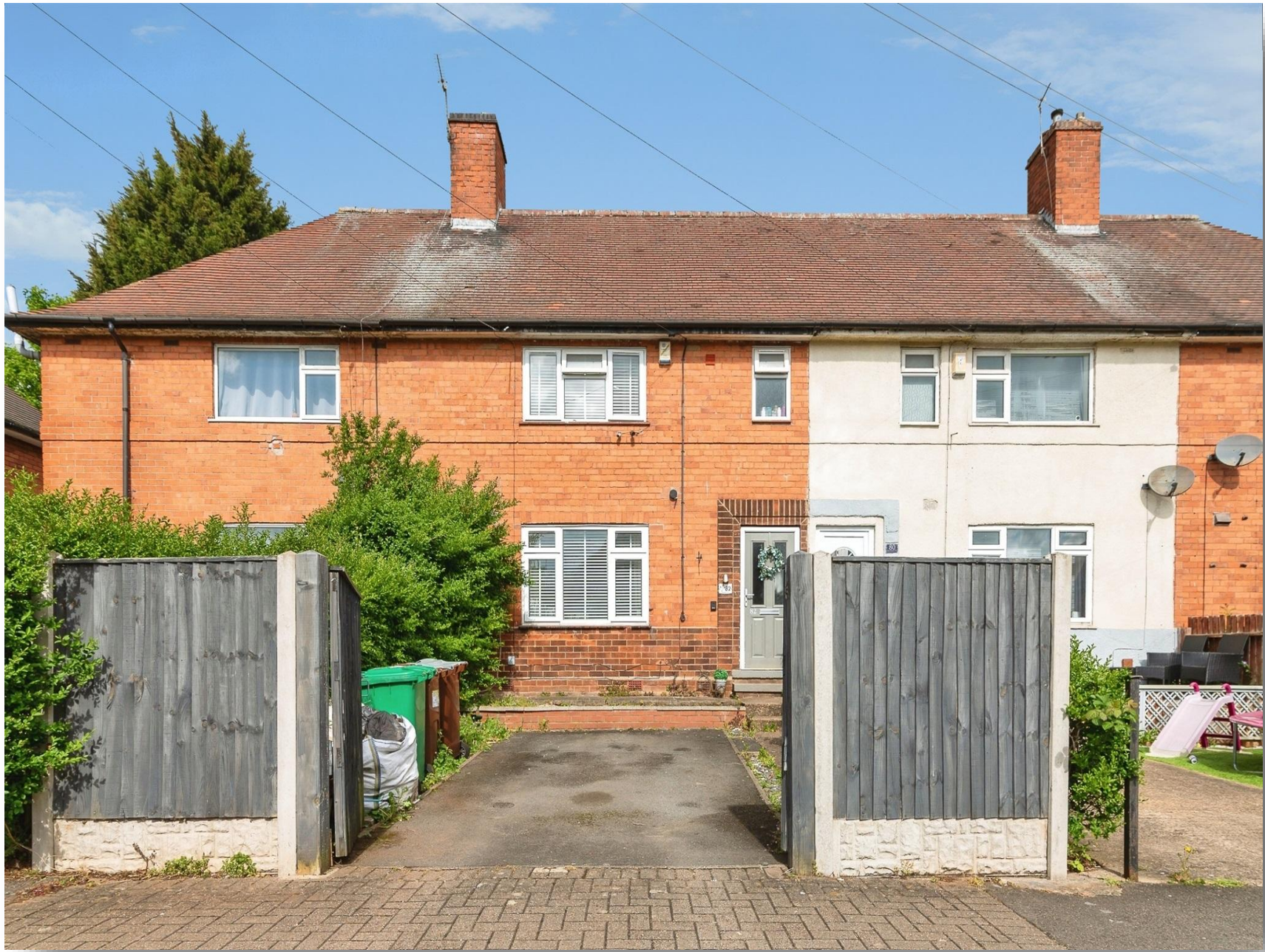
Deepdene Way, Nottingham NG8 6BH