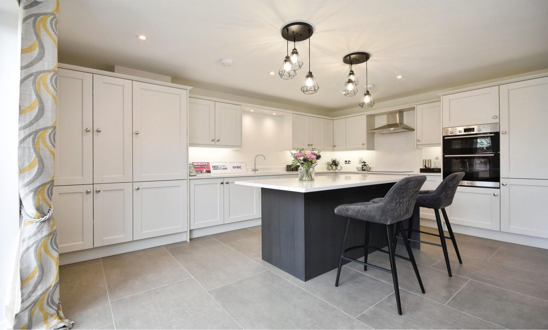
The Medlar, The Orchard, Kedington, Haverhill CB9 7NN