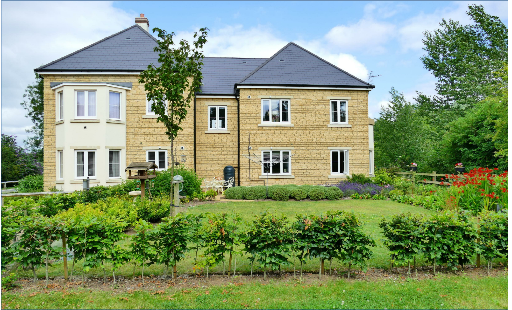
Station Road, Calne £230,000