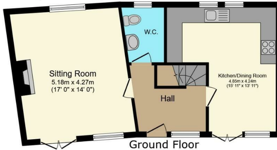
Ground Floor Floor area 48.9 sq.m. (526 sq.ft.)