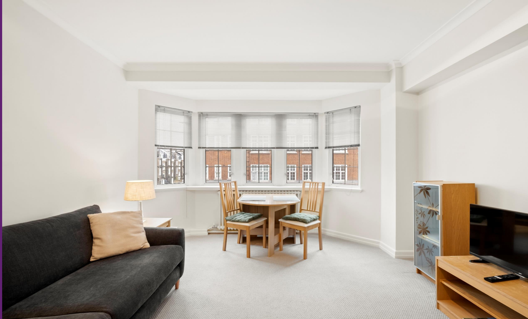
Troy Court Kensington High Street, W8