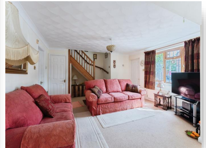
Cardiff Close, Great Sutton Ellesmere Port CH66 2GR