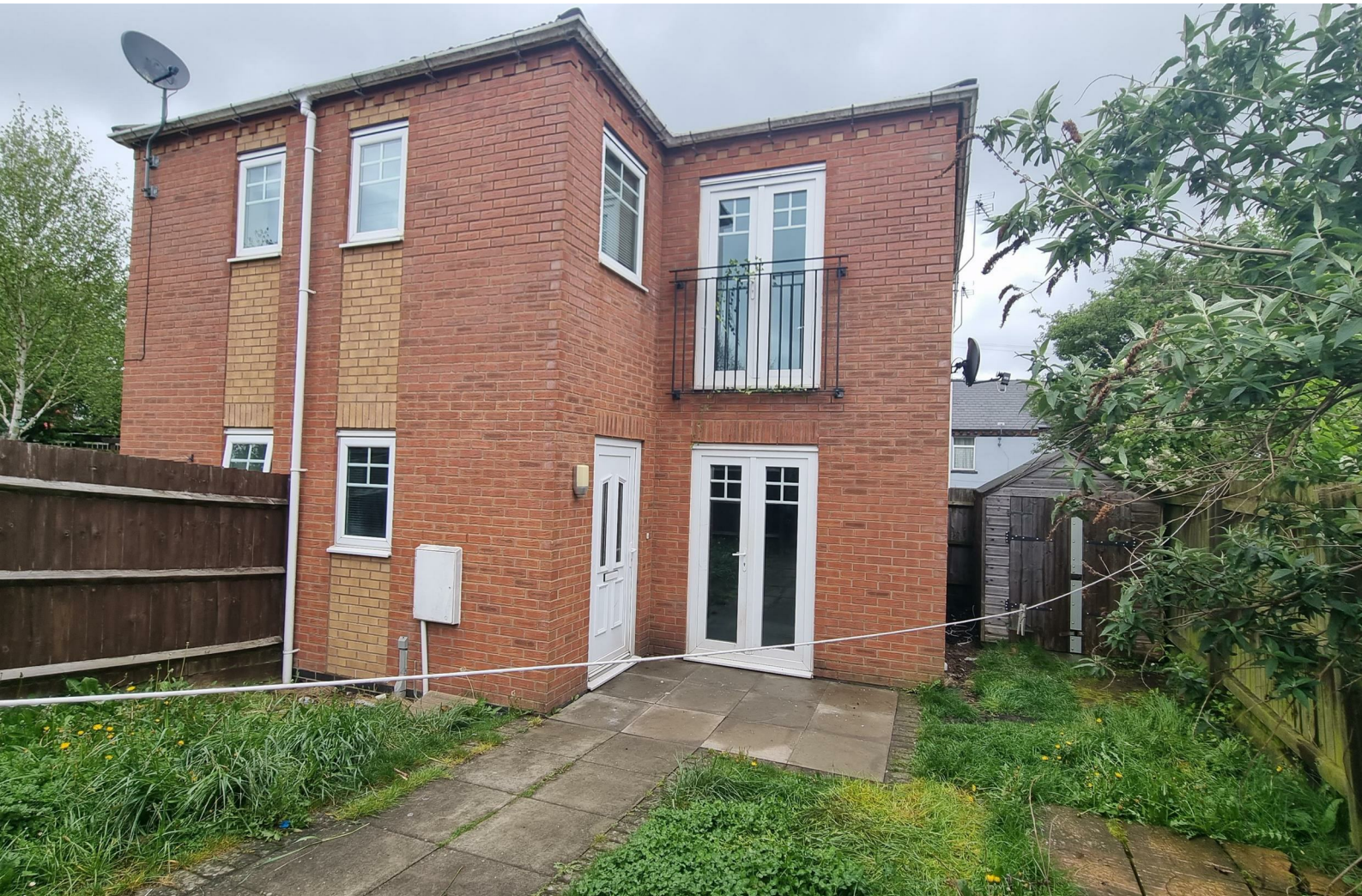
30 Clarence Street, DY3 1UP