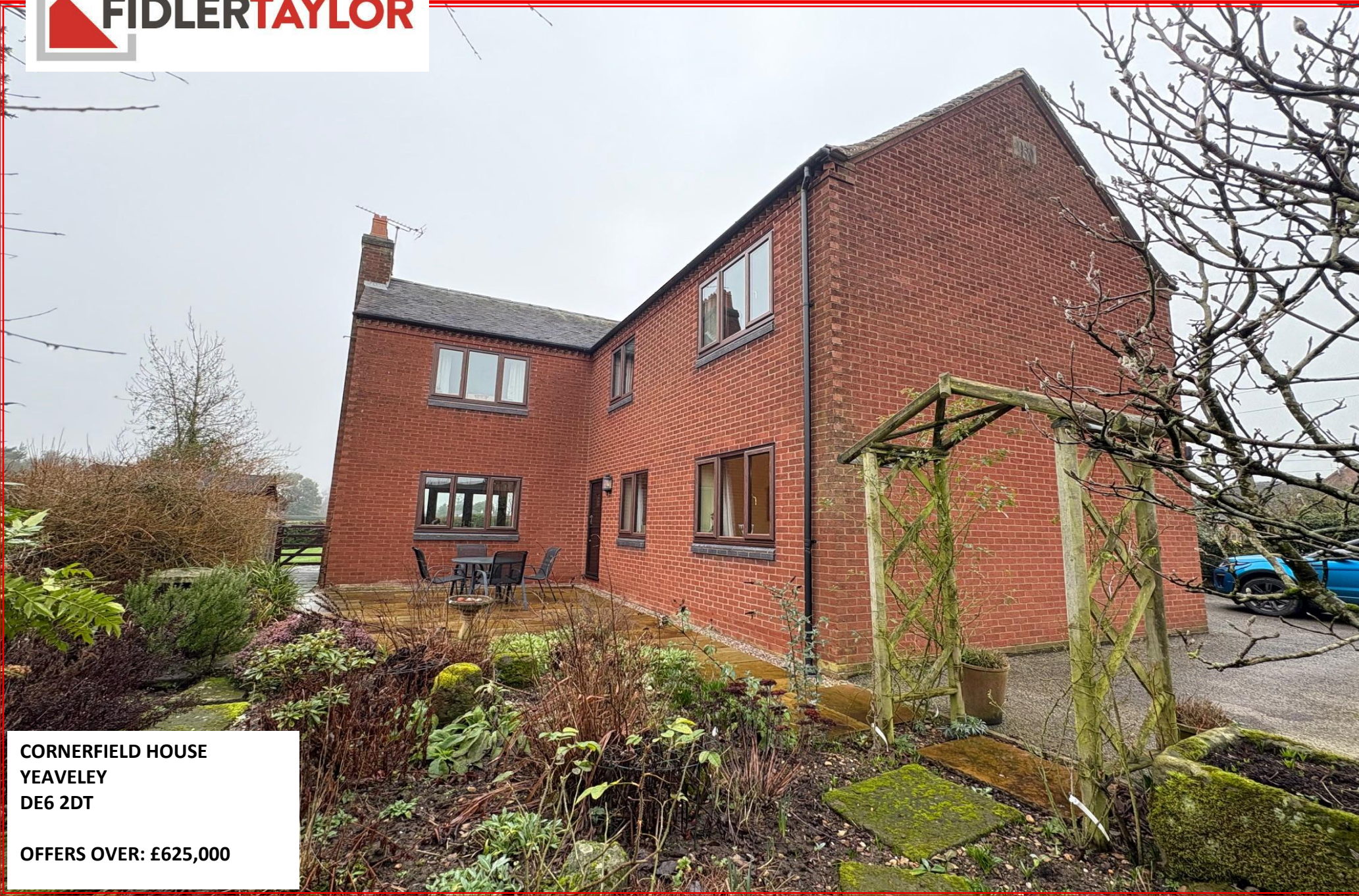
CORNERFIELD HOUSE YEAVELEY DE6 2DT