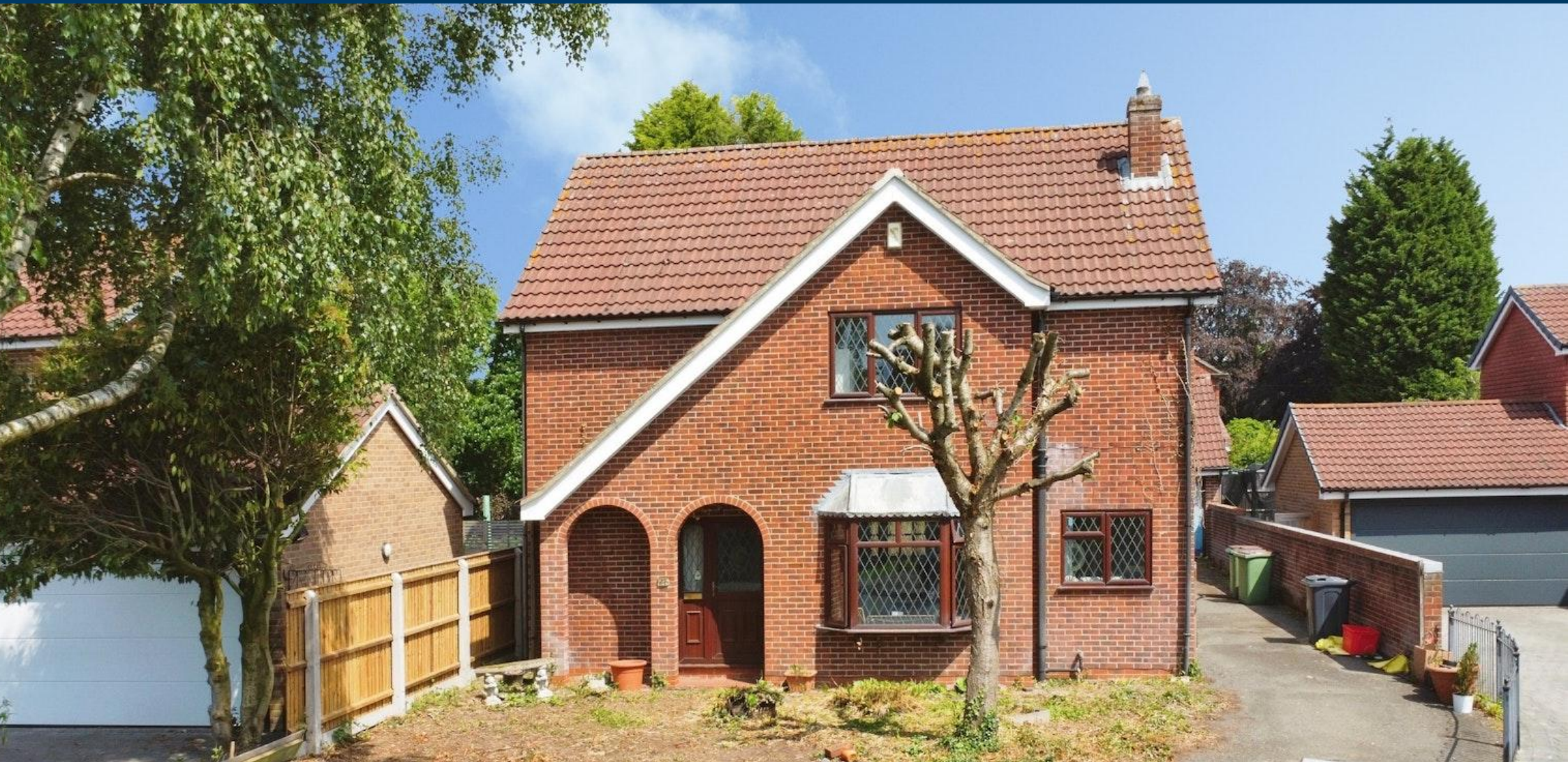
The Grange, Packington