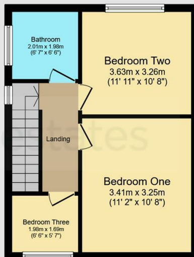
First Floor Floor area 38.1 sq.m. (410 sq.ft.)

Total floor area: 80.2 sq.m. (864 sq.ft.)