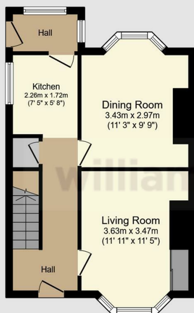
Ground Floor Floor area 42.1 sq.m. (453 sq.ft.)