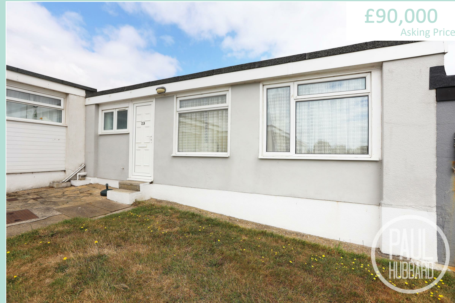
SEAVIEW CHALET 501 sq.ft. (46.6 sq.m.) approx.