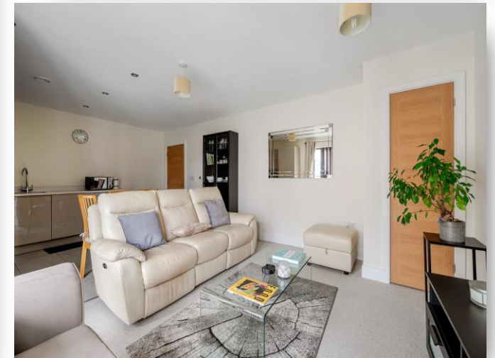
Flat 50 Lansdowne Place, Institute Road, Taplow, Maidenhead SL6 0FD