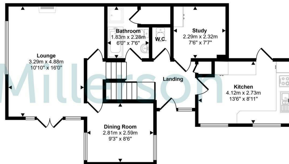
Ground Floor Approx 60 sq m / 644 sq ft

This floorplan is only for illustrative purposes and is not to scale. Measurements of rooms, doors, windows, and any items are approximate and no responsibility is taken for any error, omission or mis-statement. Icons of items such as bathroom suites are representations only and may not look like the real items. Made with Made Snappy 360.