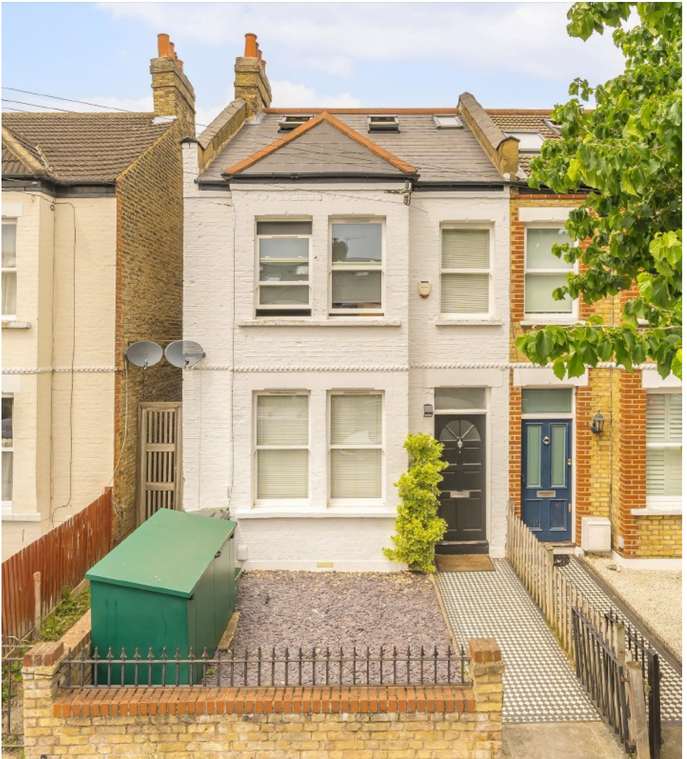
Faraday Road, SW19 £1,125,000