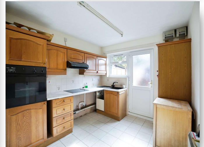
Vinery Court, Ramsey Huntingdon PE26 1JZ