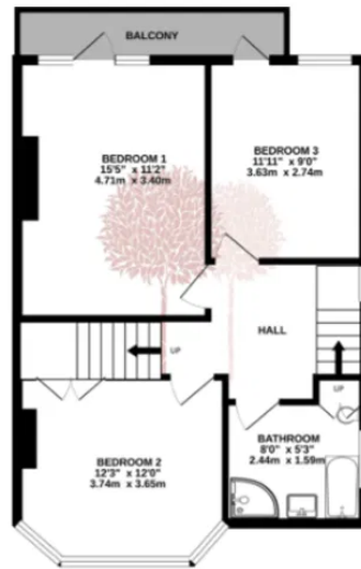
1ST FLOOR 545 sq.ft. (50.6 sq.m.) approx.