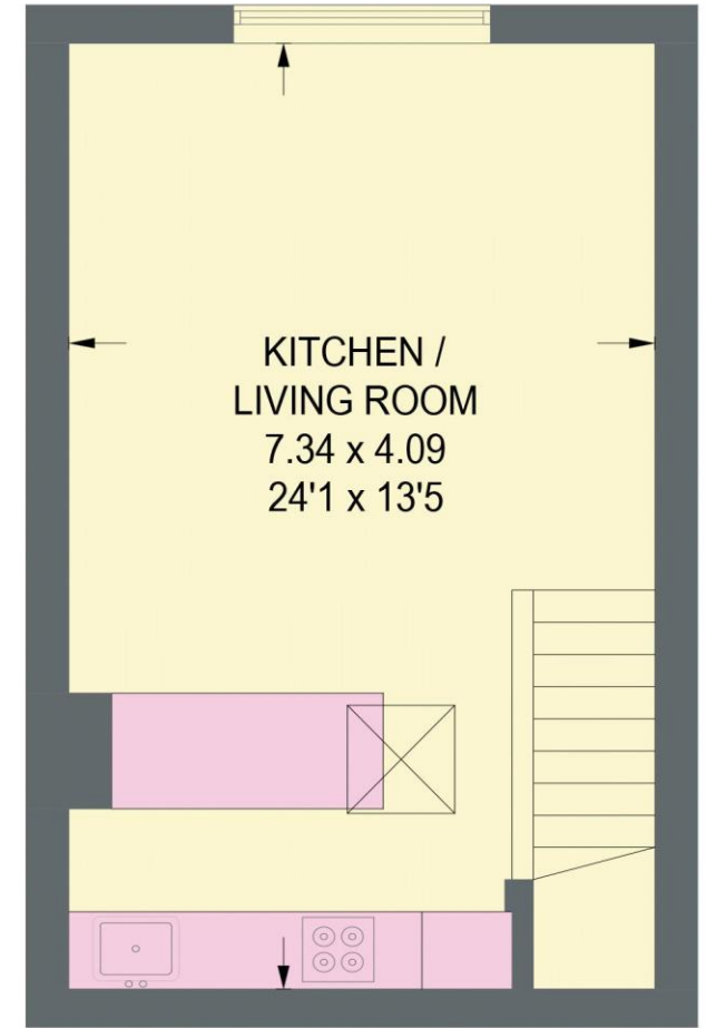
SECOND FLOOR 30.1 SQ M / 324 SQ FT

Illustration for identification purposes only, measurements are approximate, not to scale.