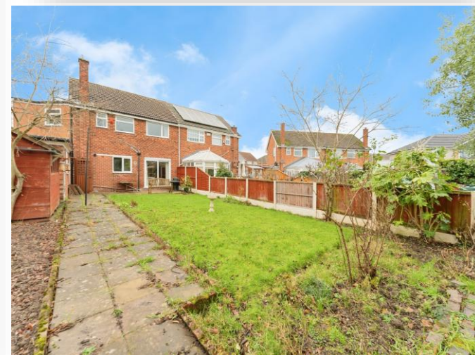
Broadland Road, Great Sutton Ellesmere Port CH66 2JR