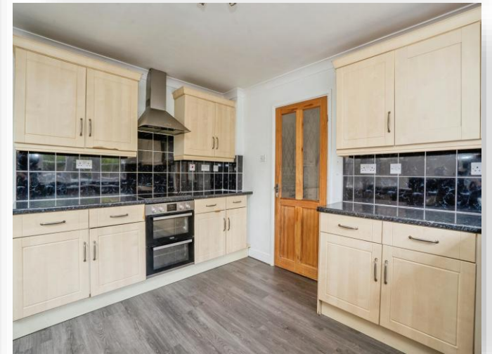
Dresden Drive, Waterlooville PO8 8RN