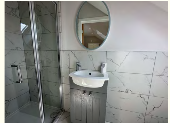
Bedroom 1 En Suite