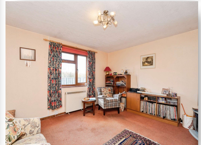
Groveside, East Rudham, King's Lynn, PE31 8RL