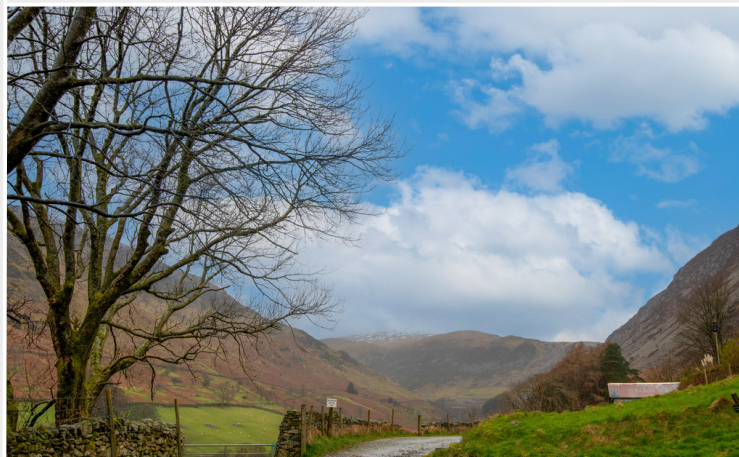
Stunning fell views