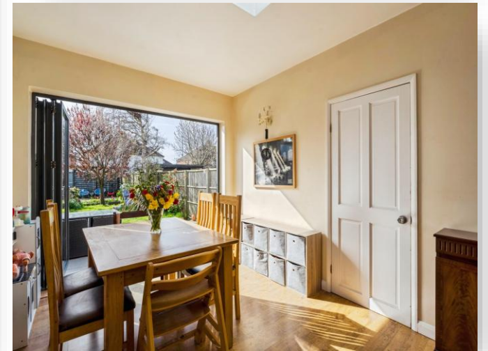
West Way, Lancing, BN15 8LU